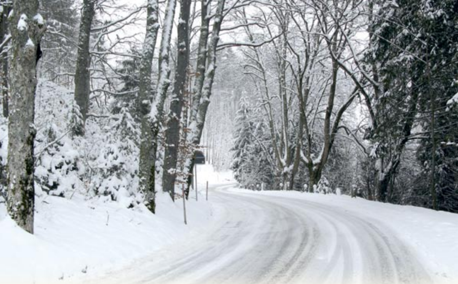
The road to the Girard-Perregaux Manufacture was scenic

60% of a casino's profits today are derived from such one-armed bandits or fruit machines, as they are so-called.